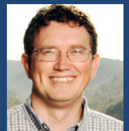
Rep. Thomas Massie